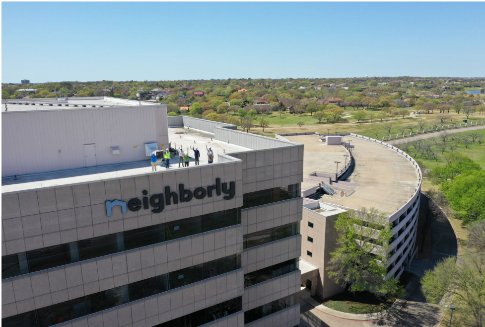
Waco-based Neighborly is opening a second headquarters in Las Colinas. (KOA Partners )